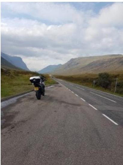
👉 Glen Coe