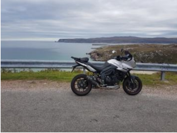
Tiger @ Durness

Awoke to yet another nice day. After breakfast my plan was to ride to Durness 65 miles from Ullapool on my favourite UK road, then went across to Tongue before it was time to head back. Once you are this far north there are very few roads that I haven't been down previously but I managed to find a single track road back to Ullapool. 45 miles into my 85 mile journey I experienced the first rain of my trip. I stopped at a little village called Lairds to put on my waterproofs then rode to Ullapool arriving at 5pm. I left at 6 for my long walk into town for dinner and beers. Sadly the only thing to be gleaned from this trip is biking heaven, but I already knew this, BUT what a waste of time and money, another day riding around on my own.