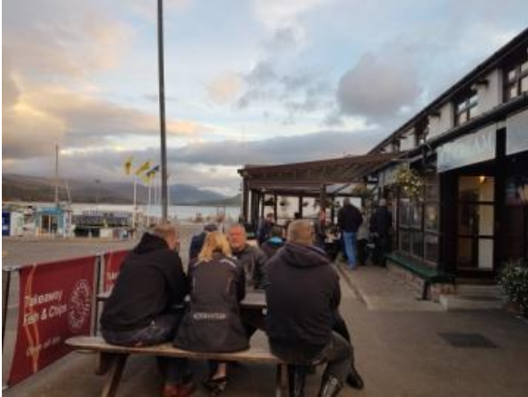
Seaforth Hotel, Ullapool

It rained all night so woke to wet roads. Breakfast was had, filled up the Tiger which is running great - I am really gelling with it on this trip - so smooth, easy to ride and brilliant mpg. On the road for 9.30 - a gentle day today as it's only 90 miles to Ullapool - going to take the coast road and have lunch at Gairloch. Lunch was a meal deal from Morrisons, I got there early to obtain mayo free sandwiches. The ride was biking heaven, tiger running great, out of this world scenery and great weather. Lunch was indeed at Gairloch then a lovely road, which I was mostly the only person on the 60 miles to Ullapool and arrived at my B & B at 4pm. Walked into town at 7pm to find all the other Triumph owners who will meet at the Seaforth Hotel where we will discuss tomorrows routes.