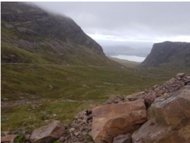
Over the pass from Applecross